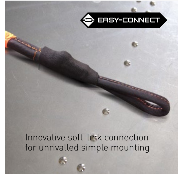
Innovative soft-link connection for unrivalled simple mounting